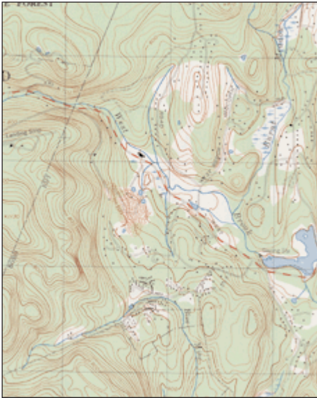
Part of a 7.5-minute topographic map at 1:24,000 scale.

A topographic map tells you where things are and how to get to them, whether you're hiking, biking, hunting, fishing, or just interested in the world around you. These maps describe the shape of the land. They define and locate natural and manmade features like woodlands, waterways, important buildings, and bridges. They show the distance between any two places, and they also show the direction from one point to another.